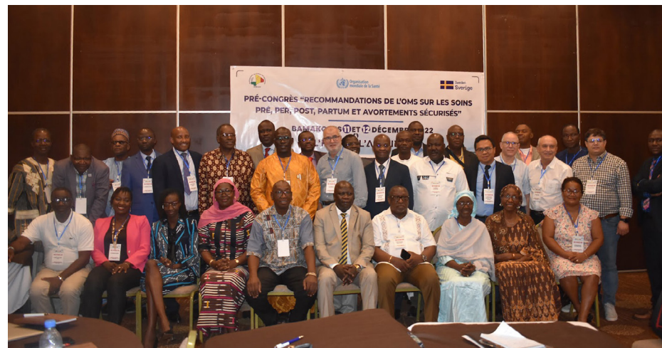
SAGO-FIGO Community of Practice members, December 2022, Mali

Current priorities include the creation and strengthening of advocacy strategies relevant to each country context that Community of Practice members can take forwards to further drive advocacy for safe abortion across the region, as well as development of further opportunities for direct peer-to-peer learning and mentoring within the region.