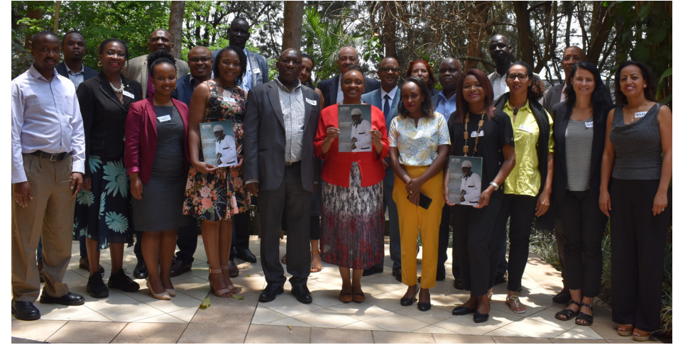
ECSACOG-FIGO Community of Practice meeting, October 2022, Rwanda