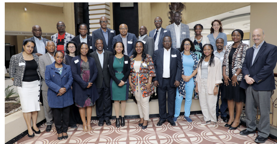
ECSACOG-FIGO COP meeting, Ethiopia, March 2023