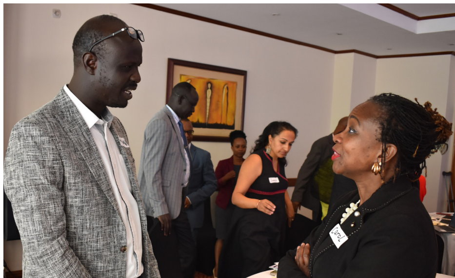
ECSACOG-FIGO members from South Sudan and Kenya at Community of Practice meeting, Rwanda, October 2022

Our Communities of Practice enable OBGYNs to share, learn and motivate each other, taking ideas back to their own societies to inform and implement.